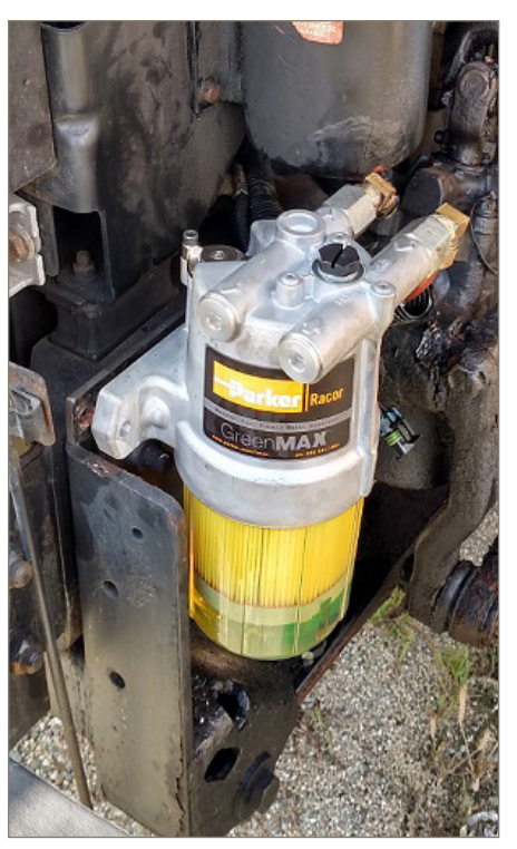
Fed Ex delivery truck retrofit. GreenMAX assembly part number used, 6600R10.